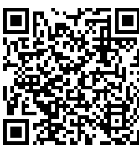
Download Mobile for Apple