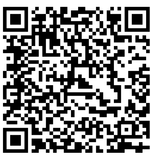
Download Mobile for Android